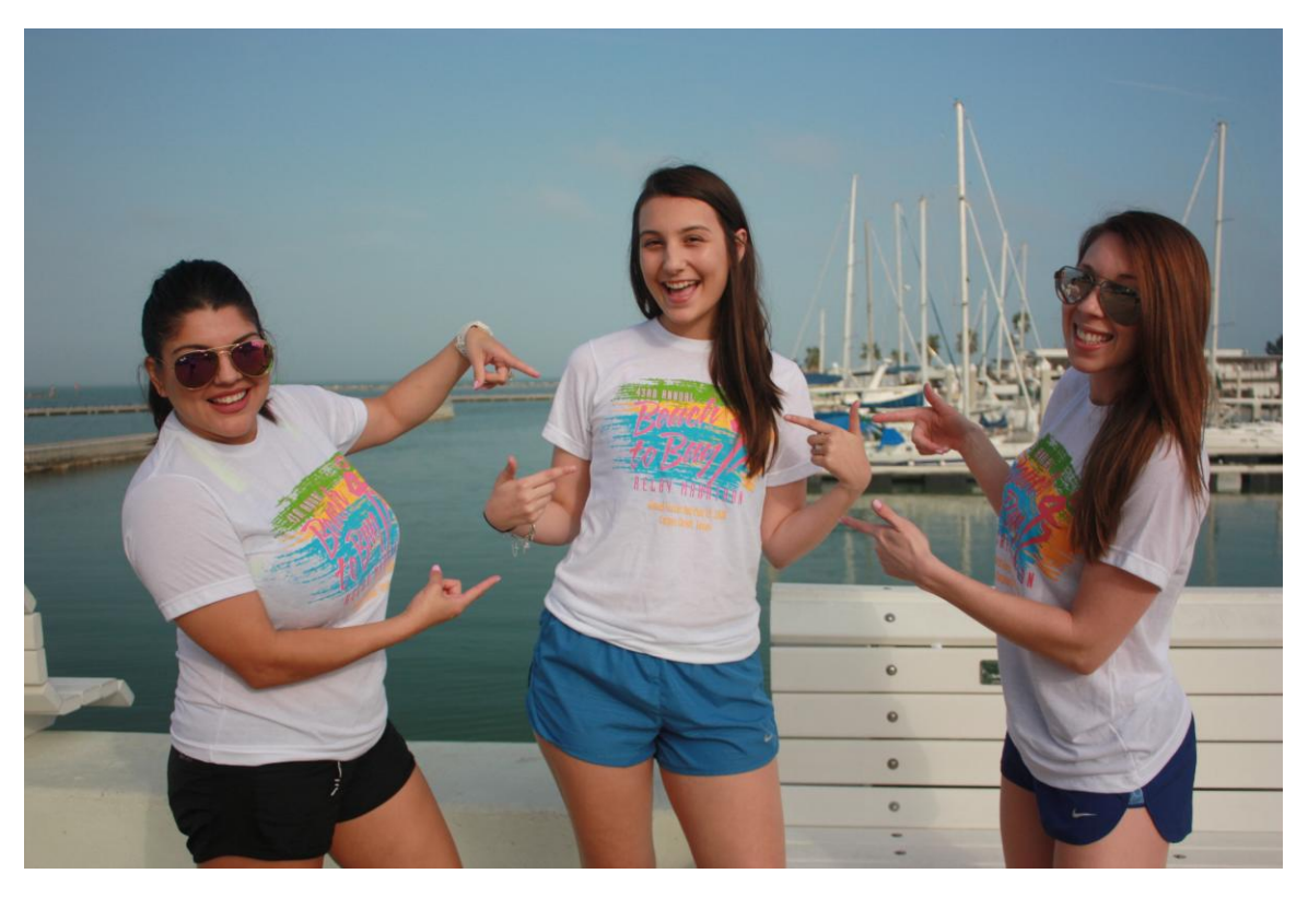
The 45<sup>th</sup> Annual Beach to Bay Relay Marathon Saturday, May 16, 2020